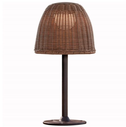
Shown in graphite brown / brown

COLOR RENDERING . . . . . 90 CRI LAMP COLOR . . . . . 2700K LUMENS/WATT . . . . . 133.57 LUMINOUS FLUX . . . . . 1122 lumens