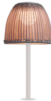
Shown in natural white / light beige

The Atticus M/39 Outdoor Lamp is light and simple in design yet sophisticated with its charm, offering versatility in its application across various settings. This lamp is at home in both indoor and outdoor spaces and creates a welcoming environment. The shade is hand-woven out of recyclable, non-toxic synthetic polyethylene fiber, and inside is a UV-resistant polyethylene globe diffuser. The lamp mounts to a counter or tabletop and is hardwired to the included wet-rated connection box containing the driver. Dimmable with a TRIAC dimmer.