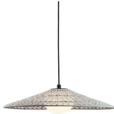
Shown in graphite brown / beige