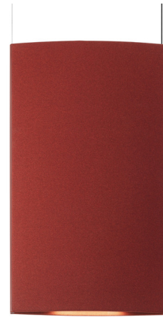
Shown in black / terracotta

COLOR RENDERING . . . . . 95 CRI LAMP COLOR . . . . . 3000K LUMENS/WATT . . . . . 150.00 LUMINOUS FLUX . . . . . 2160 lumens