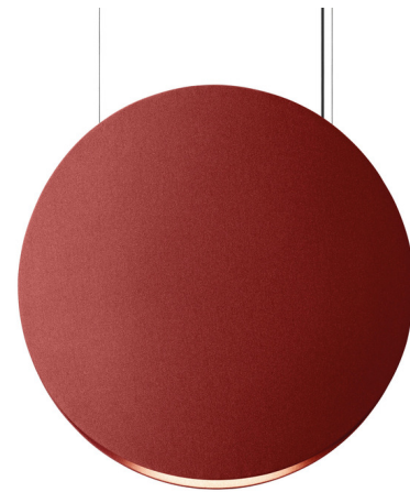
Shown in black / terracotta

COLOR RENDERING . . . . . 95 CRI LAMP COLOR . . . . . 3000K LUMENS/WATT . . . . . 150.00 LUMINOUS FLUX . . . . . 2160 lumens