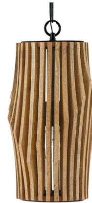
Shown in matte black / mango wood / mango wood

PRODUCT DIMENSIONS . . . . . Chain: 120"