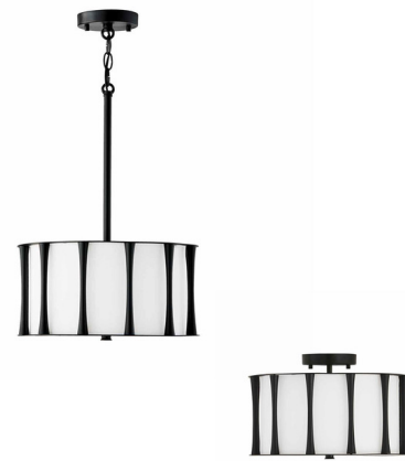
Shown in matte black / white

PRODUCT DIMENSIONS . . . Downrods Included: 1-6", 1-12" and 1-18" and 12" Chain