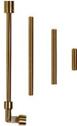
Shown in: Antique Bronze

Standoff vault adapter installs between the rigid or adjustable standoff (sold separately) and the ceiling to position rail parallel to the floor. Includes several rod lengths to achieve the proper pitch when used with a surface transformer. Finish in Satin Nickel, Chrome or Antique Bronze. ETL listed. 0.6W x 1.6H.