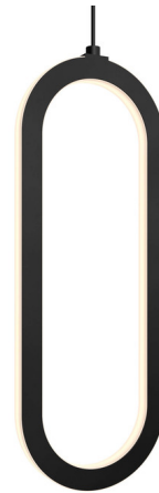
Shown in black / frosted