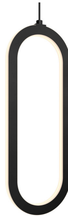
Shown in black / frosted

LAMP LIFE . . . . . 50000 hours COLOR RENDERING . . . . . 90 CRI LAMP COLOR . . . . . CCT Select LUMENS/WATT . . . . . 34.17 LUMINOUS FLUX . . . . . 820 lumens