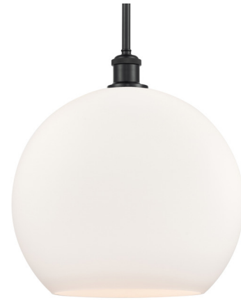
Shown in matte black / matte white

PRODUCT DIMENSIONS . . . . . Downrods: One 6" and Two 12" Included