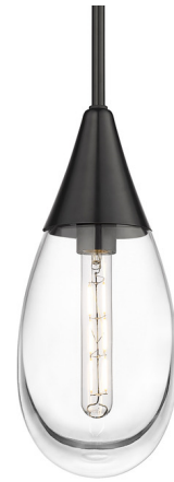
Shown in matte black / clear

The Malone Stem Hung Pendant features a stunning water droplet-shaped glass shade that exudes elegance and fluidity. The organic curves of the droplet design evoke a sense of calm and refinement, perfectly complementing modern and transitional interiors. Its smooth, minimalist frame highlights the beauty of the glass, creating a captivating glow that enhances any kitchen, dining, or living space. NOTE: This is a stem hung pendant and includes 1-6 and 2-12 inch (1/2 diameter) stems.