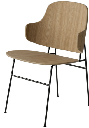
Shown in black / natural oak

Originally designed by Danish architect Ib Kofod-Larsen in 1953, the Penguin Dining Chair remains popular today as an icon of Scandinavian mid-century design. Penguin is lightweight and elegant, with a gently curved back and seat crafted from plywood with a wood veneer. The steel legs provide a stable base and contrast the chair's organic curves with straight lines.