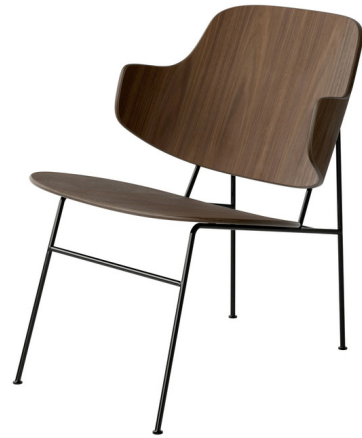
Shown in black / walnut

Originally designed by Danish architect Ib Kofod-Larsen in 1953, the Penguin Lounge Chair remains popular today as an icon of Scandinavian mid-century design. Penguin is lightweight and elegant, with a gently curved back and seat crafted from plywood with a wood veneer. The steel legs provide a stable base and contrast the chair's organic curves with straight lines.