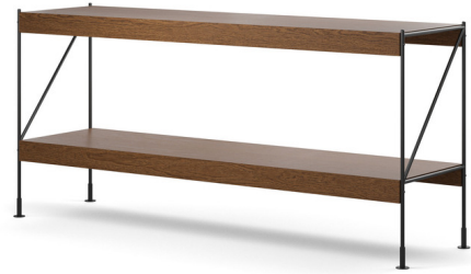
Shown in black / dark oak

The Zet Storage System is a minimalist, modular shelving system that is perfect for displaying the decorative objects that define a space. The shelf is constructed of two simple components, U-shaped shelves in oak veneer and a steel frame, for an airy, open look that will complement virtually any interior.