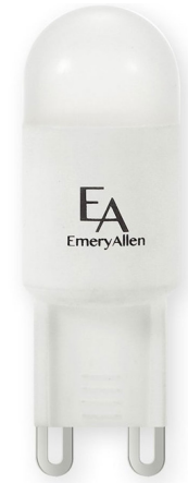
Shown in frost

LAMP LIFE . . . . . 25000 hours BEAM ANGLE . . . . . 360° COLOR RENDERING . . . . . 90 CRI LAMP COLOR . . . . . 2700K Warm Dim LUMENS/WATT . . . . . 80.00 LUMINOUS FLUX . . . . . 200 lumens