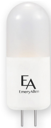
Shown in frost