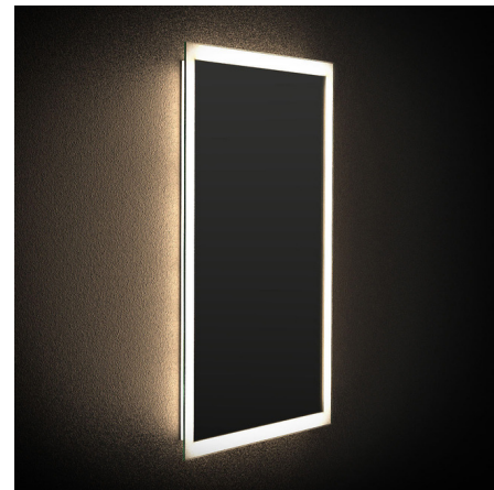
Shown in mirror

LAMP LIFE . . . . . 50000 hours COLOR RENDERING . . . . . 90 CRI LAMP COLOR . . . . . 3000K LUMENS/WATT . . . . . 62.50 LUMINOUS FLUX . . . . . 3750 lumens