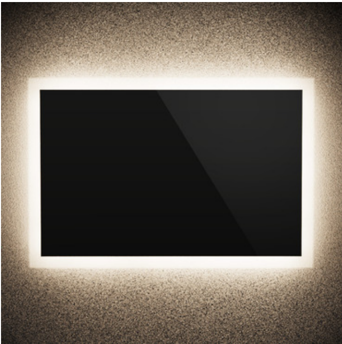
Shown in: Mirror

A perfect blend of form and function, the Classic L02I Horizontal Full Frame Edge Indirect LED Mirror offers sleek, modern appeal with its simple lines and frosted border while providing the right amount of indirect illumination for your daily grooming routine. High-quality materials, craftsmanship, and energy-efficient LED lighting make this mirror a long-lasting solution for your space. Notes: The mirror must be installed horizontally. A vertical version is sold separately.. The mirror is available with or without an anti-fog demister that defogs the center area of the mirror. The anti-fog demister voltage is 120V and it must be on an independent switch, or can be on the same switch as the mirror if it is 120V non-dimming.