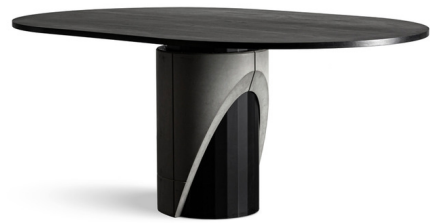
Shown in black / grey

Over the past 150 years, concrete has become a ubiquitous material used for a wide variety of construction applications thanks to its durability and versatility. But it is often overlooked that every concrete building requires a skeleton of steel rebar to provide structure and support. Designer Bertrand Jayr explores the relationship of concrete and steel with the Sharp Dining Table. The Sharp Table's columnar base is accented by a concrete sleeve, which is cut away to reveal the faceted steel structure underneath. The sleeve can be installed up or down for two distinctive looks. The table is capped with an oblong, oak veneer tabletop which provides the texture of natural wood as a contrast to the base's modern, industrial styling. With a simple silhouette and bold black finish, Sharp will serve as an eye-catching, architectural centerpiece in a modern interior.