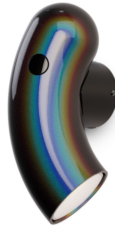
Shown in chromatic black steel

COLOR RENDERING . . . . . 80 CRI LAMP COLOR . . . . . 3000K LUMENS/WATT . . . . . 76.92 LUMINOUS FLUX . . . . . 1000 lumens