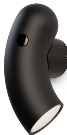
Shown in sandy black

COLOR RENDERING . . . . . 80 CRI LAMP COLOR . . . . . 3000K LUMENS/WATT . . . . . 76.92 LUMINOUS FLUX . . . . . 1000 lumens