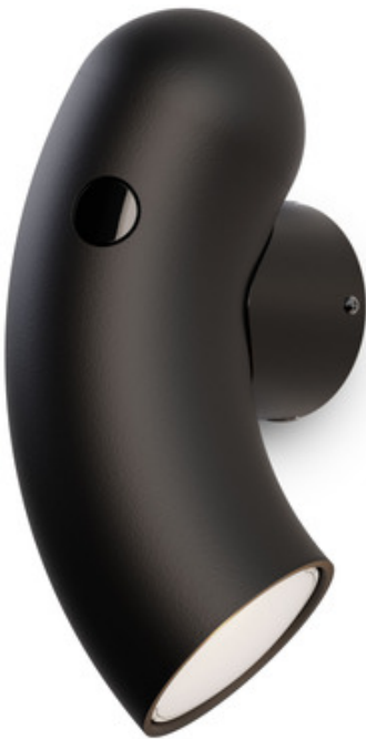
Shown in: Sandy Black

The body of the Hyphen Wall Light is composed of a curving cylindrical form anchored by a round backplate. The cylinder can be rotated to direct the light beam up or down. Each lamp is hand-crafted by skilled artisans in Morin-Heights, Quebec. Available with a steel body in matte Sandy Black, Chromatic Black which reflects changing colors, or with a matte white Natural Porcelain body.