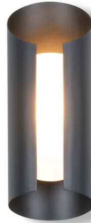
Shown in matte black / alabaster

Crafted from high quality alabaster and metal, this mesmerizing Enza Wall Sconce design is ideal to add a touch of sophistication and warmth to any room. The unique design with gentle curvature perfectly contrasts the sharp edges, giving a mid-century appeal that will compliment any home.