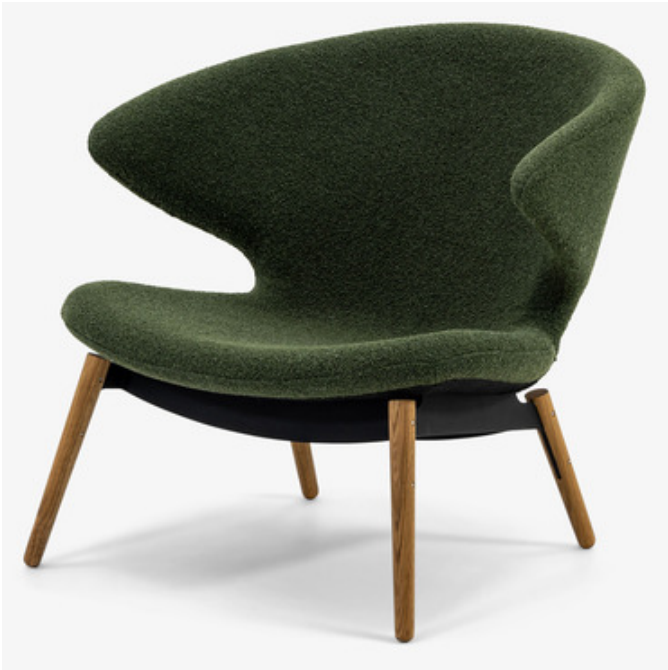
Shown in: Natural Oak / Moss Boucle

DESCRIPTION The Ella Lounge Chair offers the perfect blend of form and function with an organically curved silhouette that provides a comfortable seat. The chair gently envelopes its user with comfortable support perfect for relaxation and conversation.