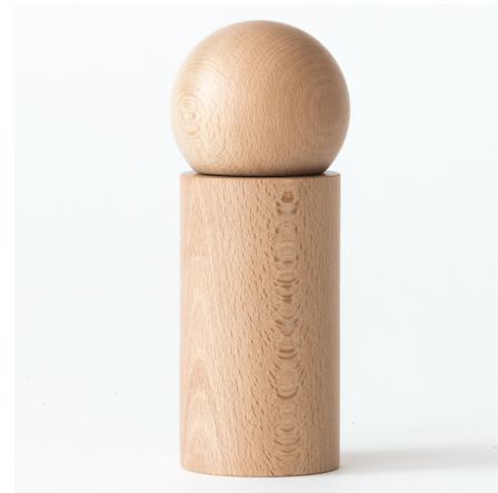
Shown in beech

The Orb Grinder features a distinctive cylindrical silhouette with a spherical top for a stylish look that will elevate any countertop. The grinder includes a CrushGrind mechanism that allows the coarseness of the grind to be adjusted with a turn of the wheel.