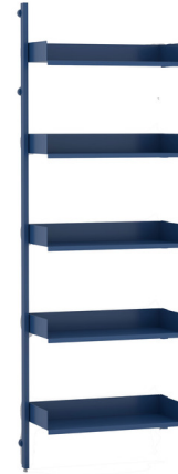
Shown in blue

The Slot Shelving Extension is an optional accessory for the Slot Shelving Unit by Case. The extension can be added onto the base unit to provide additional shelving space.