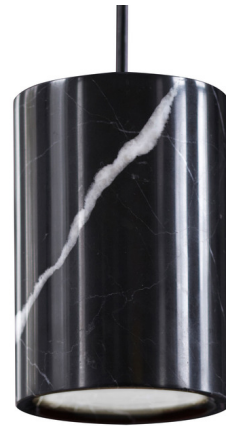
Shown in black / nero marquina marble

The Solid Cylinder Pendant features a pure, geometric form with a cylindrical shade in wood or polished marble. A rounded edge at the base of the shade adds a touch of detailed craftsmanship characteristic of the Solid collection. Solid's rich natural texture is sure to enhance any interior with understated elegance.