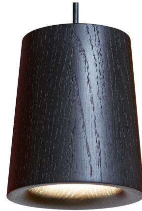
Shown in black / black stained oak

The Solid Cone Pendant features a pure, geometric form with a tapered wooden shade. A rounded edge at the base of the shade adds a touch of detailed craftsmanship characteristic of the Solid collection. Solid's rich natural texture is sure to enhance any interior with understated elegance.