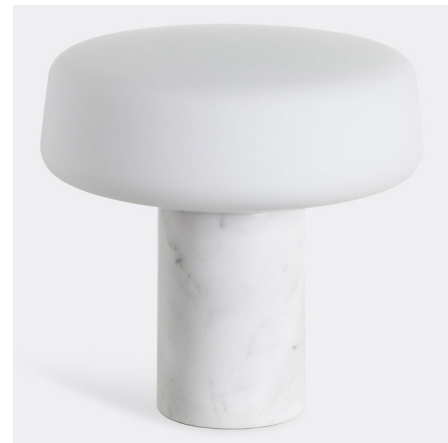
Shown in carrara marble / opal

The Solid Table Lamp offers a clean-lined design with a modern expression perfect for a variety of interiors. The cylindrical marble base is capped with a rounded opal glass diffuser with an acid-etched interior to produce a soft, diffused glow. A four-stage (100% / 60% / 20% / Off) dimmer switch is located on the base of the lamp. The color and veining of the marble base may differ due to natural variations in the material.