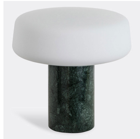
Shown in serpentine marble / opal

The Solid Table Lamp offers a clean-lined design with a modern expression perfect for a variety of interiors. The cylindrical marble base is capped with a rounded opal glass diffuser with an acid-etched interior to produce a soft, diffused glow. A four-stage (100% / 60% / 20% / Off) dimmer switch is located on the base of the lamp. The color and veining of the marble base may differ due to natural variations in the material.