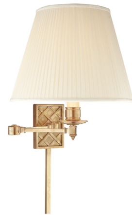
Shown in natural brass / silk

The Gene Swing Arm Wall Sconce adds a clean beauty to your interior space. The decorative backplate and swing arm is topped with a pleated silk shade that directs light where you need it. Extends from 12.75 inches to 19.25 inches. Includes matching cord cover. Hi/Lo switch is located on the lamp socket. Note: May be used as a plug-in or hardwired, see installation instructions for directions. Note: When hardwired, fixture does not cover a standard US junction box and requires a 2 x 4 inch junction box.