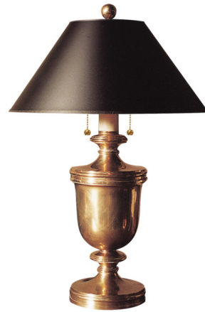
Shown in antique-burnished brass / black

The Classical Urn Table Lamp adds a midcentury modern look to your interior space. The decorative urn shaped body is topped with a tapered shade, that casts warm shadows across your room. Dual pull chains for independent light operation.