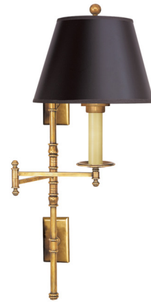
Shown in antique burnished brass / black

The Dorchester Double Plate Swing Arm Wall Sconce brings a midcentury modern look to your interior space. The decorative frame extends from 12 inches to 24 inches. Topped with a wide shade that casts warm light across your room. Hi/Lo switch is located on the lamp socket. Note: May be used as a Plug-in or Hardwired. Note: If hardwired, fixture does not cover a standard US junction box and requires a 2 x 4 inch junction box. Lower backplate holds the power wires.