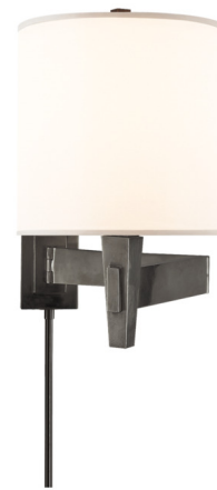
Shown in bronze / silk

The Architects Swing Arm Plug-in Wall Sconce brings a clean, classic look to your interior space. The adjustable arm is topped with a trimmed shade that casts warm light, exactly where you need it. Includes a cord cover. Dimmer is located on the lamp socket. Note: May be hardwired. If hardwired, fixture does not cover a standard US junction box and requires a 2 x 4 inch junction box.