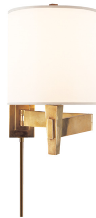
Shown in hand-rubbed antique brass / silk

The Architects Swing Arm Plug-in Wall Sconce brings a clean, classic look to your interior space. The adjustable arm is topped with a trimmed shade that casts warm light, exactly where you need it. Includes a cord cover. Dimmer is located on the lamp socket. Note: May be hardwired. If hardwired, fixture does not cover a standard US junction box and requires a 2 x 4 inch junction box.