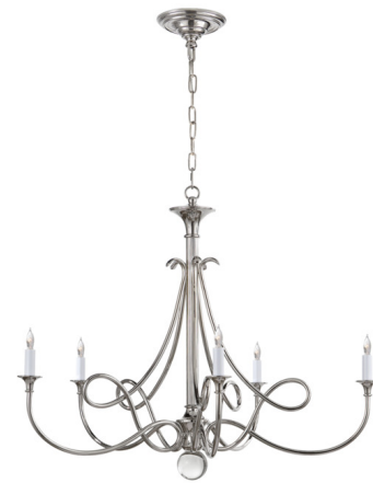
Shown in polished nickel

COLOR N/A BODY FINISH Polished Nickel WATTAGE 300W DIMMER Standard 120V DIMENSIONS 36"W x 29.75"H BULB NOT INCLUDED 5 x B10/Candelabra (E12)/60W/120V Incandescent OTHER BULB OPTIONS 5 x B10/Candelabra (E12)/120V LED