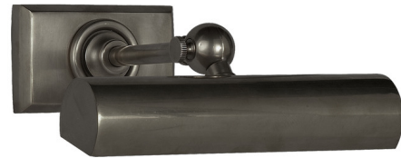
Shown in bronze

The Cabinet Makers Picture Light brings a smooth, clean style with a classic half round pharmacy shade complemented by step detailing on the arms and backplate. The warm, direct the light, creates the perfect setting for displaying your works of art. Note: Fixture does not cover a standard US junction box and requires a 2 x 4 junction box. Double Backplate options have one backplate with power supply.