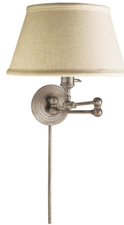
Shown in antique nickel / linen

The Boston Swing-arm Plug-in Wall Sconce brings a simple, effortless look to your interior space. The industrial frame is softened with a tapered linen shade, that swings to cast warm light exactly where you need it. Hi/Lo switch is located on the lamp socket. Matching cord cover included.