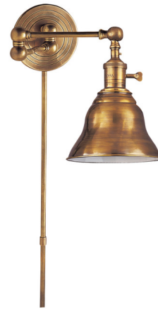
Shown in hand-rubbed antique brass

The Boston Bell Swing-arm Plug-in Wall Sconce brings a simple, effortless look to your interior space. The industrial frame complemented with a bell shaped matching shade, that swings to cast warm light exactly where you need it. Hi/Lo switch is located on the lamp socket. Matching cord cover included.