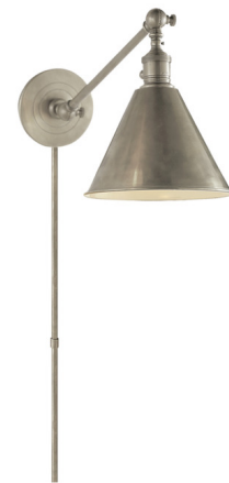
Shown in antique nickel

The Boston Functional Plug-in Library Sconce brings a simple, effortless look to your interior space. The industrial frame complemented with a cone shaped matching shade, that has an adjustable arm(s) to cast warm light exactly where you need it. Hi/Lo switch is located on the lamp socket. Matching cord cover included.