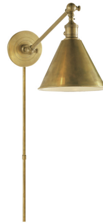
Shown in hand-rubbed antique brass