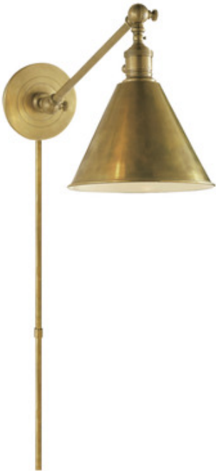
Shown in: Hand Rubbed Antique Brass

The Boston Functional Plug-in Library Sconce brings a simple, effortless look to your interior space. The industrial frame complemented with a cone shaped matching shade, that has an adjustable arm(s) to cast warm light exactly where you need it. Hi/Lo switch is located on the lamp socket. Matching cord cover included.