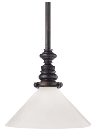
Shown in bronze / white glass

PRODUCT DIMENSIONS . . Downrods: One 18" Fixed, One 18" Removable Included