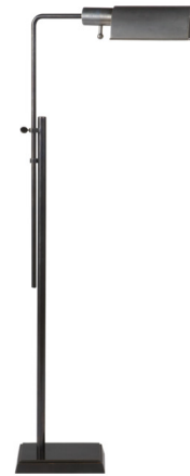
Shown in bronze

The Pask Pharmacy Floor Lamp offers style through its sleek aesthetic, and practicality with its adjustable height. The shade casts the light right where it's needed, making this lamp an ideal addition to reading nooks, office and other spots that require task lighting.