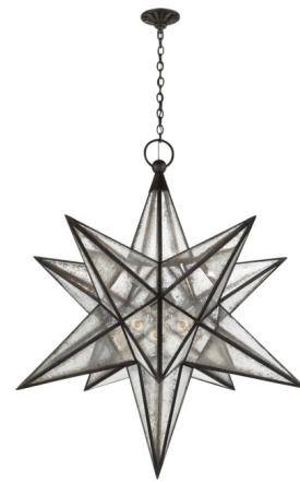
Shown in aged iron / antique mirror

The Moravian Star Pendant combines worn metal finishes with antiqued mirror glass panels to create a charming vintage aesthetic. Styled as a single pendant or clustered in multiples to form a starry installation, this geometric lighting lends a jewelry-like accent to your interior space. The 12.25 inch wide pendant is rated for damp locations, and the other sizes are rated for dry. Note: The 48 inch wide pendant requires additional ceiling support due to its weight.