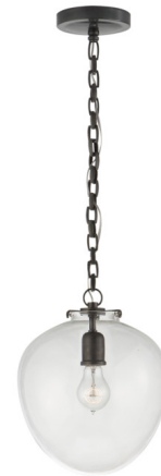
Shown in bronze / clear