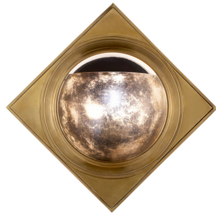
Shown in hand-rubbed antique brass / antique mirror

The distinctive Venice Wall Sconce is characterized by its diamond-shaped metal base with a circular cutout for the light. Its rounded glass shade has a mottled effect, adding an artistic touch to the design.