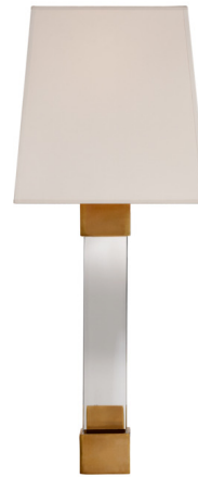
Shown in antique brass / crystal / silk

The Edgar Wall Sconce brings a midcentury modern vibe to your interior space. The smooth Crystal torch body is accented with metal ends and topped with a tapered rectangle shield shaped silk shade that casts a warm glow of light across your room. NOTE: This is a discontinued floor model and limited to quantity on hand.