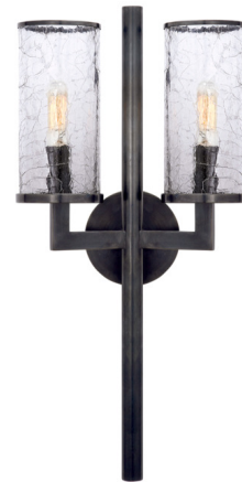
Shown in bronze

The Liaison Double Wall Sconce is a modern update of the classic candlestick sconce design, defined by its clean silhouette and simplified lamp holders with bobeches. Choose smooth clear glass or no glass for a sleek look, or the fractured crackle glass for a more vintage or rustic feel. Note: Fixture does not cover a standard US junction box and requires a 2 x 4 inch junction box.