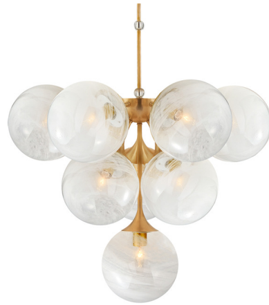
Shown in hand-rubbed antique brass / white striae

PRODUCT DIMENSIONS . . . . . Downrods: Three 6" Included