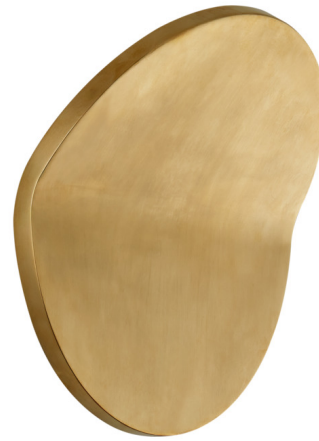
Shown in natural brass

The Bend Round Wall Sconce brings a clean minimalism to your interior space. The simple, circular body is bent in the middle and complemented with a polycarbonate diffuser that cast a warm glow of light against your wall.