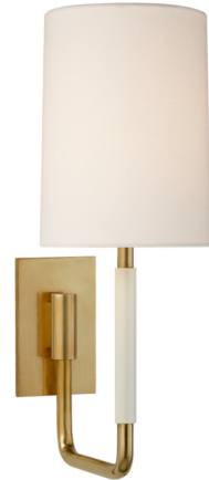
Shown in soft brass / linen

The Clout Wall Sconce brings a clean look to your interior space. The decorative body, with resin accent, is topped with a tall linen shade that casts a warm glow of light across your room. Note: Fixture does not cover a standard US junction box and requires a 2 x 4 inch junction box.