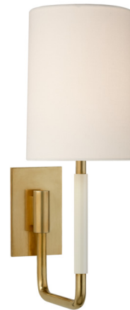
Shown in soft brass / linen

The Clout Wall Sconce brings a clean look to your interior space. The decorative body, with resin accent, is topped with a tall linen shade that casts a warm glow of light across your room. Note: Fixture does not cover a standard US junction box and requires a 2 x 4 inch junction box.